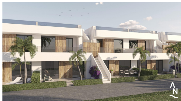
BUNGALOW TIPO B Vivienda 02-01-06-08