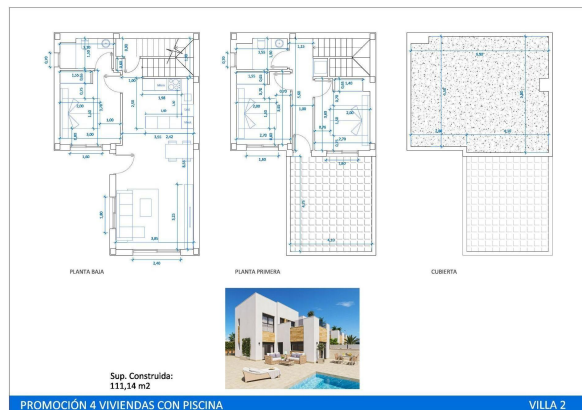
PROMOCIÓN 4 VIVIENDAS CON PISCINA