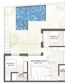
PB / GROUND FL